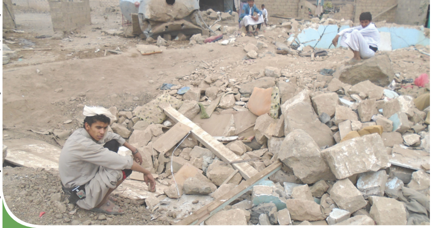
Two children sitting on the ruins of their home destroyed in a Saudi airstrik.