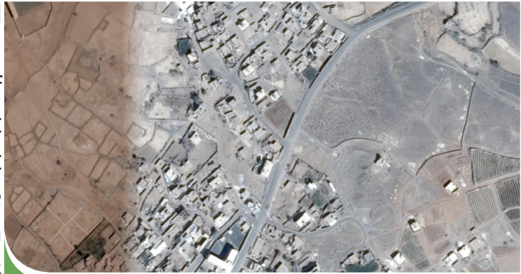
Satellite picture shows Al-Hadirah village set.

After three months of the starting of the military operation in Yemen ,the Saudi-led coalition targeted Al-Hadirah village which is 8 km far away in the east south of the capital city – Sanhan district –Sana'a governorate , killing lots of civilians in this period without any legality and morality , it is a crime regarding to the international humanitarian law. The simple houses of this village houses many innocent civilians who didn't take part in the hostility .