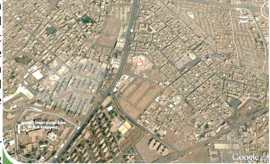
The Workers' City near the US Embassy This picture proves the absence of any military sites

The Workers' City, built by the Yemeni government in the early nineties to integrate "AL-Muahamshine" the marginalized ones in the society and employ them as street cleaners, is one of the neighborhoods which located in Sh'aup district, a home for more than 5000 street cleaners and their families. This city lies on the east of the capital Sana'a near the tourist city 1km far from the United States Embassy in Sana'a, which evacuated its employees since the beginning of the war.