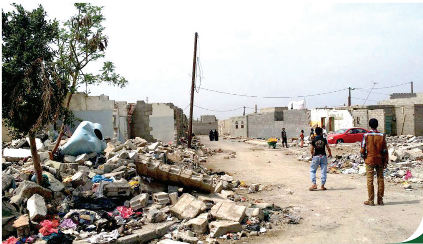
Some houses were completely destroyed