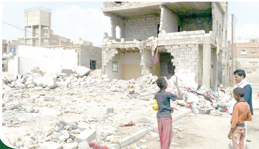
A photo shows the eight houses which had been completely destroyed