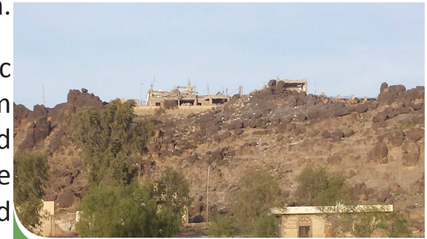
the Seismic Monitoring Center in Hran area

Many civilian objects such as Seismic Mentoring Center, Dhamar Museum and university buildings, were destroyed without an objective reason. These facilities are not military targets and hadn't been used for military purpose so this violation mounts to a war crime. Legal Center and a lot of international