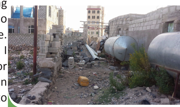
Al- Fatimy House

survived. What is the reason for killing us ?!! I really I don>t know. There is no military targets near or in this place. I wonder what we did to them?!. I have no family and no house now for what ?!!. My psychological condition is unspeakable. My life turned into nothing". He couldn>t continue as tears were pouring from his eyes (2).