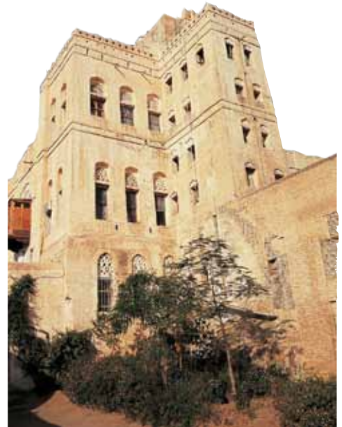
One of the historical buildings in Zabed city

The Saudi-led coalition and its war planes launched an attack on the civilians, civil institutions, historical and archeological places, residential areas, commercial shops, "Al-Baisha" a historical mosque ,and the crowded marketplace of Zabed , leaving tens of civilians dead and critically wounded.