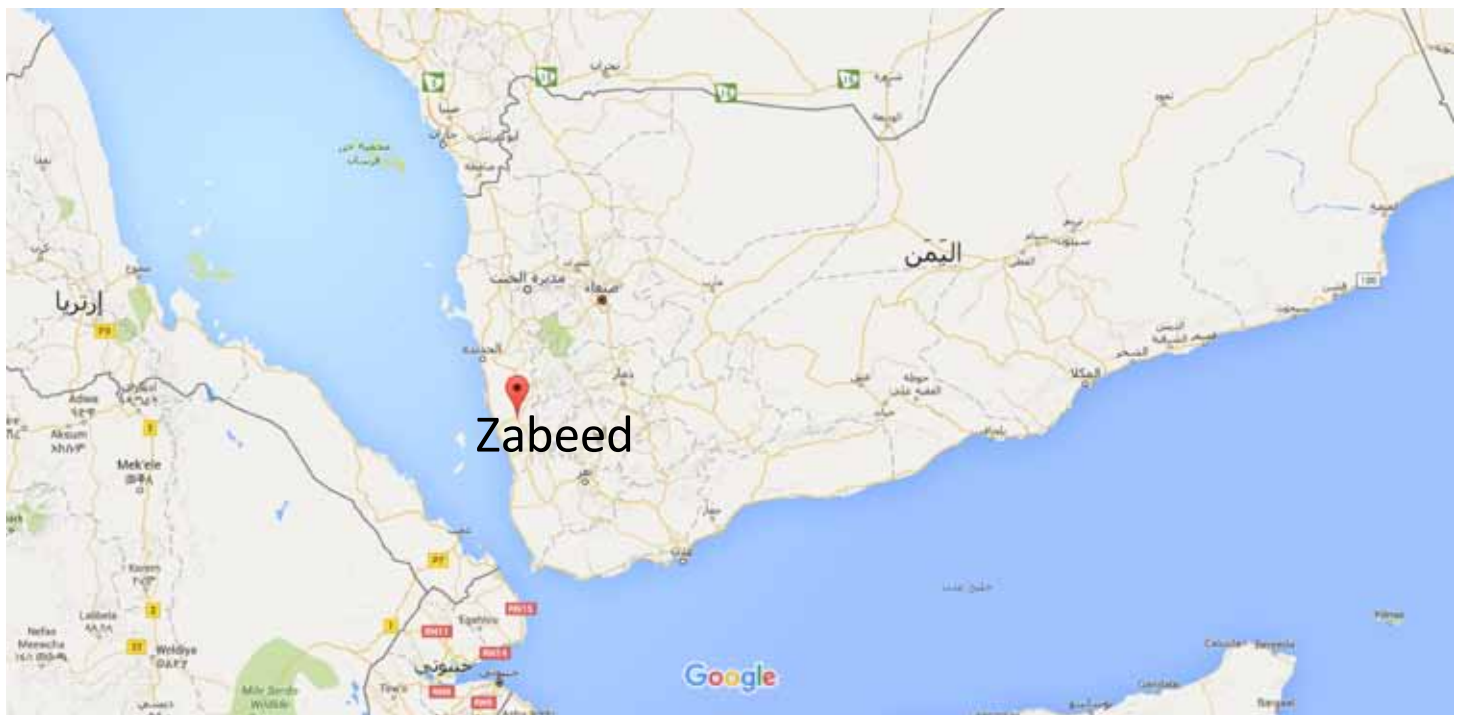
Zabeed city map

Legal Center visited the targeted place and documented the crime by conducting interviews with victims, their relatives, witnesses ,and official employs, also by visiting the hospital to which many victims were rushed and taking photos and videos for victims.