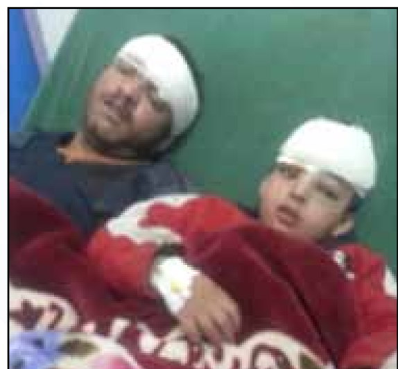
A father and his young daughter both were wounded