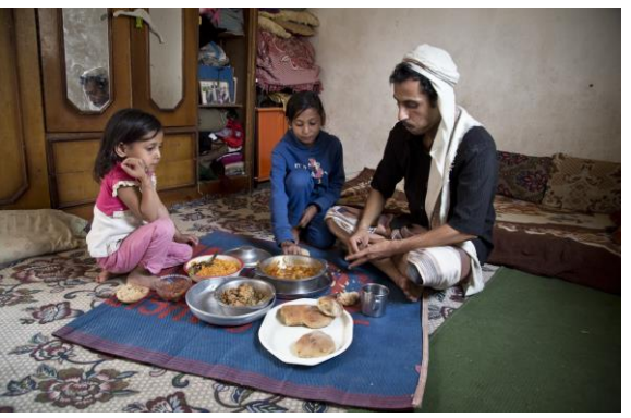
Humanitarian partners have reached a record number of Yemeni families with food assistance.

insecurity crisis. A staggering 17 million people (approximately twothirds of Yemen's population) are food insecure; this includes 6.8 million severely food insecure people who face the risk of famine. Seven out of 22 governorates of Yemen are under Emergency (IPC Phase 4) – Taizz, Abyan, Sa'ada, Hajjah, Al Hudaydah, Lahj, and Shabwah; while four governorates – Taizz, Abyan, Al Hudaydah and Hadramaut have Global Acute Malnutrition (GAM) rates above the WHO's 15 per cent critical threshold. In 67 districts across 13