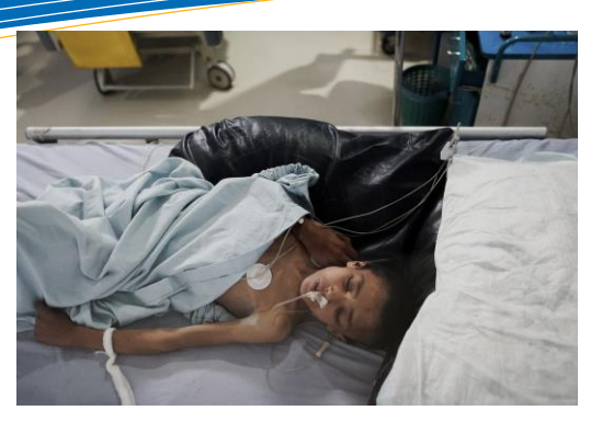
A suspected cholera patient awaits treatment at Al Jomhouri hospital in Sana'a.

55.8 per cent funded (29 October 2017) Source: FTS, October 2017