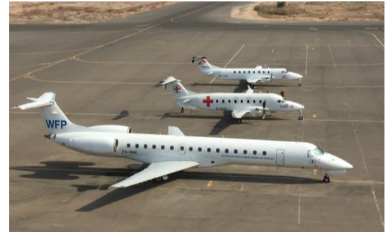
Since August 2016, aid workers can only get in and out of Sana'a using humanitarian flights.

UNHAS also provided transport to 26 journalists and media outlets interested in covering the humanitarian crisis in Yemen. However, in September 2017, due to the systematic denial of clearance by the Saudi-led Coalition to the boarding of journalists on UN flights, their inclusion in the travel manifest has been suspended. While the humanitarian community continues to advocate for media to use the service, journalists are now advised to use commercial carriers to travel to Yemen.