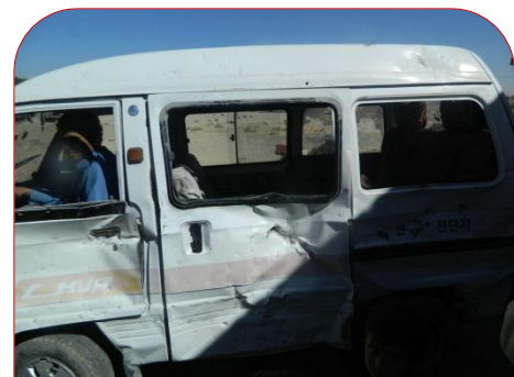
Basheer Khalid Sultan and damages caused to his bus

The bombing resulted in the injuring of two women who were with me on the bus, and only minutes later another driver came in his car and took the wounded to the hospital. I then saw about 4 other people injured on the bus".