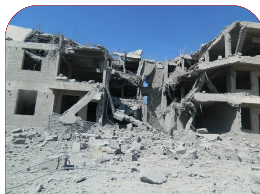
The rubble of the targeting building

The warplanes of the Saudi coalition continue destroying Yemen's infrastructure and target innocent civilians and civil installations. On Sunday, November 5, 2017, warplanes of the Saudi alliance launched three airstrikes on a building near the main road in Al-Khamis Of Bani Harith district in Sana'a capital during the passing of civilians and civil vehicles.