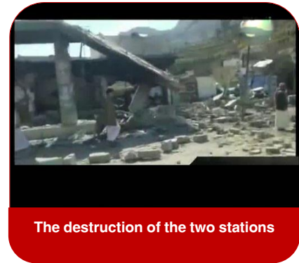
The destruction of the two stations

"At approximately 02:00 A.m, the Saudi coalition warplanes launched three air raids on the Beni Rabia'ah area in Razih district of Sa'ada governorate. The raids targeted two fuel stations belong to citizens Ahmad Salah Nashwan and Yahya Meshqa'a destroying them completely in addition to the shops attached to them, as well as the of trucks and damaging some cars".