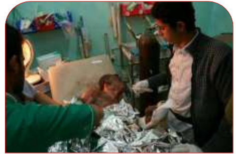
One of the injured victims while receiving treatment