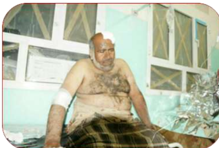
Photos of some victims