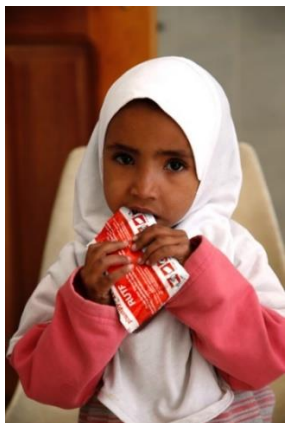
Pictured: a child with ready-to-use therapeutic food in Sana'a, Yemen