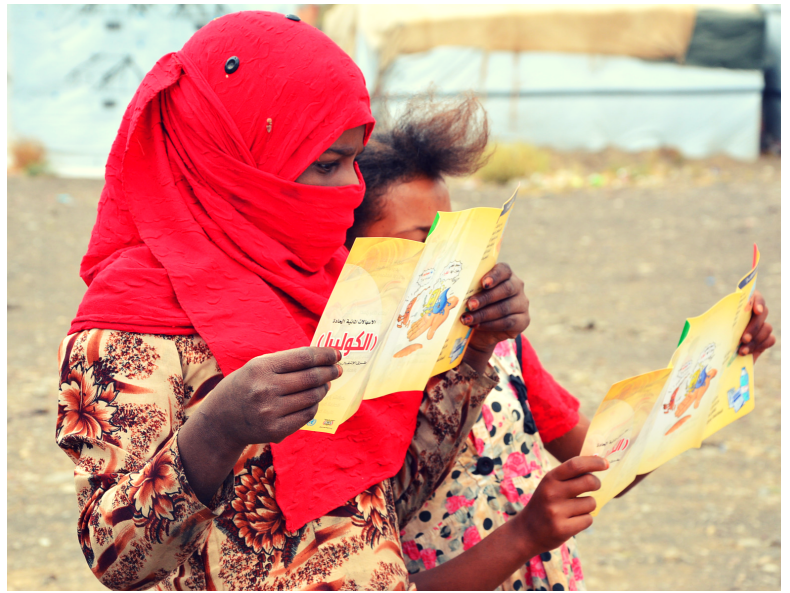
Displaced girls in Arman read about cholera prevention