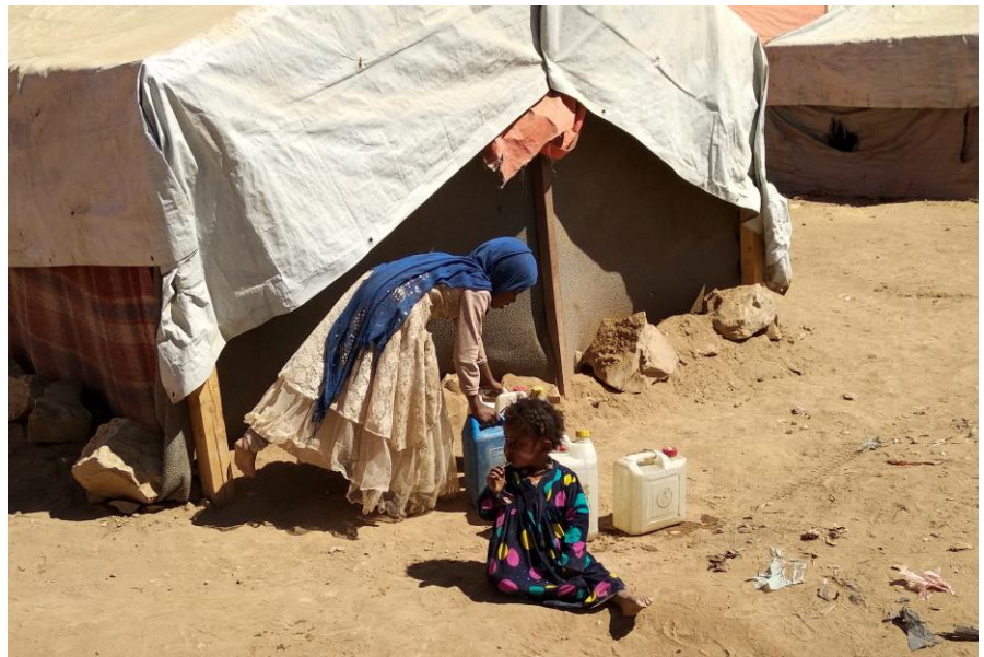
Children carrying water in AlJaheen Spontaneous Settlement, Raydah district, Amran Governorate.

List of Sub-National Cluster Coordinators is available at https://goo.gl/btmviv