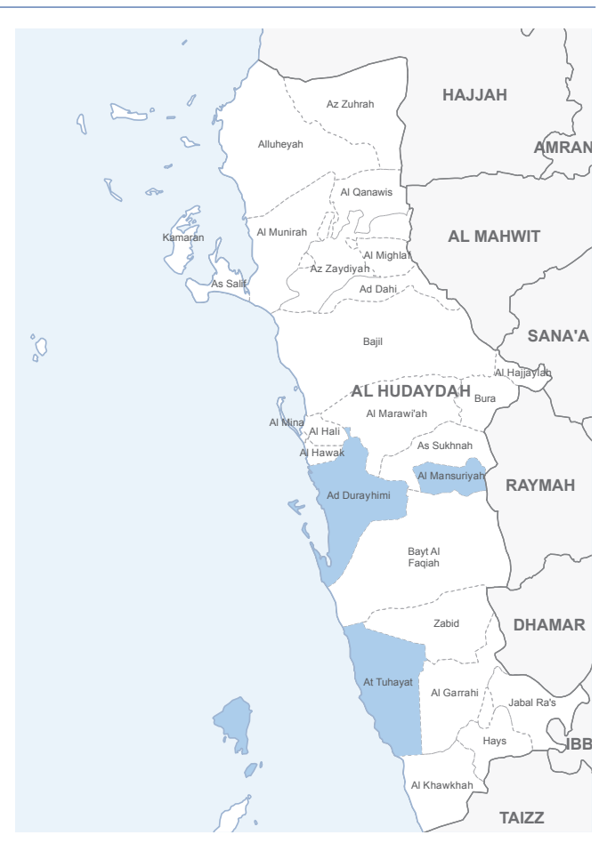
Map of Al Hudaydah showing districts with ongoing clashes.

About 12,000 people in As Safra District are still without clean water following damage to the Nushur water facility during fighting in July. Partners estimate that repairs may take 6 to 12 months and cost more than US$600,000. Local water authorities are assessing the exact damage. Since July, the affected communities have depended on water from shallow wells.