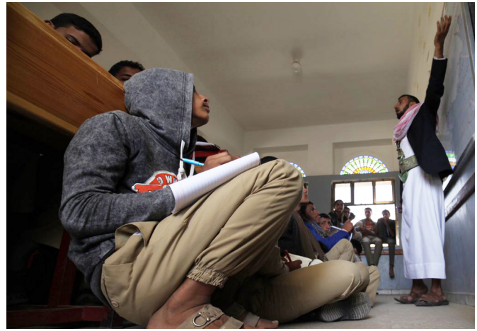
Schools in Al Hudaydah city are open but many parents fear to send children to attend class.