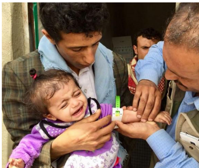
Despite the dire situation, humanitarian workers are working hard to assist as many people as possible.

Since June, Rapid Response Mechanism (RRM) partners have identified a total of 71,212 displaced families from Al Hudaydah Governorate hosted in Al Hudaydah, Hajjah, Raymah and Al Mahwit governorates and 62,375 have received assistance. This includes 16,985 families who received multi-purpose cash transfers, 19,780 families who received non-food item (NFI) packages and 7,788 families who received emergency shelter kits (ESKs).