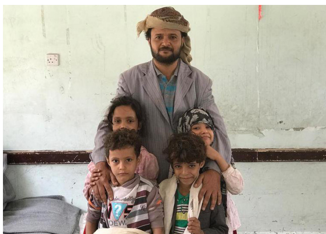
Mohammed and his family fled Al Hudaydah and sought shelter in a safer location.

school because of the security situation. Non-payment of salaries and displacement of teachers to areas outside the city has further affected the education system.