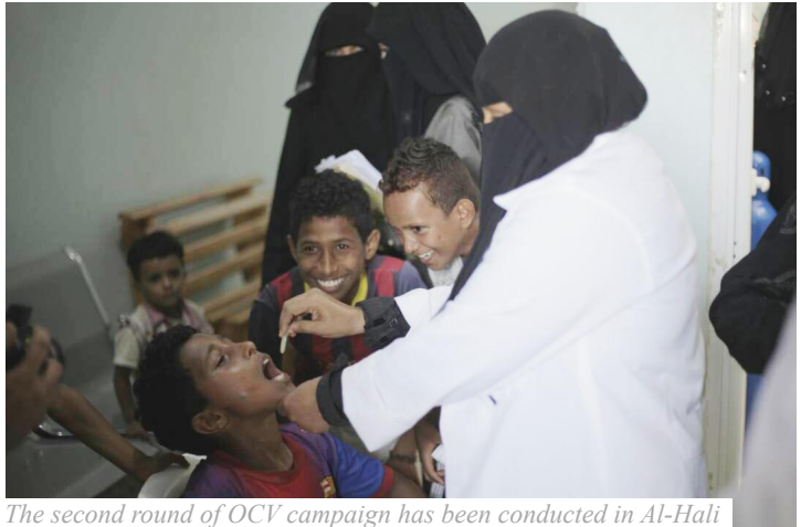
The second round of OCV campaign has been conducted in Al-Hali and Al-Marawia districts of Al-Hudaydah Governorate