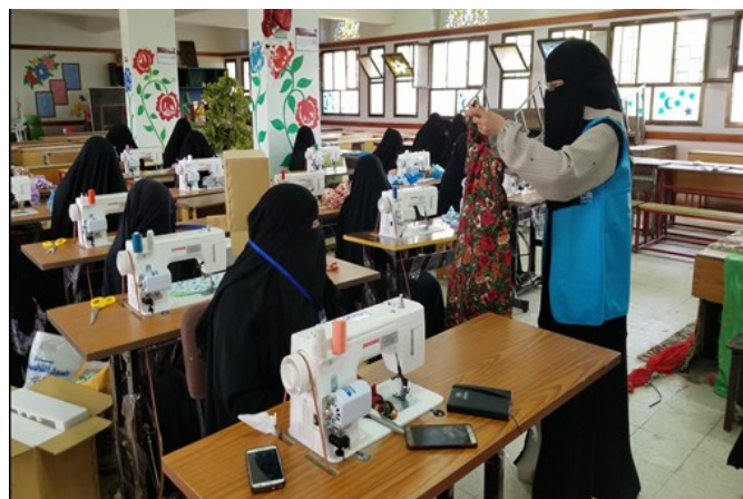
IDP and HC women participating in QIP Project, Sa'adah Governorate.

Transfer of cash for rental subsidies completed by UNHCR to 104 families in Sa'adah City and 2,721 families in Bart Al Anan, Kharab Al Marashi, Rajuzah, Al Matammah, and Az Zahir districts of Al Jawf governorate. NFIs distribution completed by ACTED for 1,004 IDP families in Monabbih district (Sa'adah) and 233 IDP families in Al Maslub district of Al Jawf Governorate and UNHCR through YDF (Yemen Development Foundation) assisted 61 displaced families with NFIs and 33 families with EESKs in Sa'adah City. To ensure the sustainability of assistance provided, UNHCR implemented two QIPs (Quick Impact Projects) targeting 40 women from the IDPs and HC in Sa'adah and Al Jawf governorates. The women were provided with trainings and sewing machines to enable them to generate income for their families.