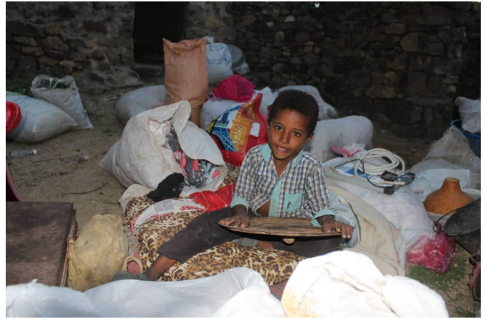
A child sitting in the open with his family belongings, Maqbanah district.