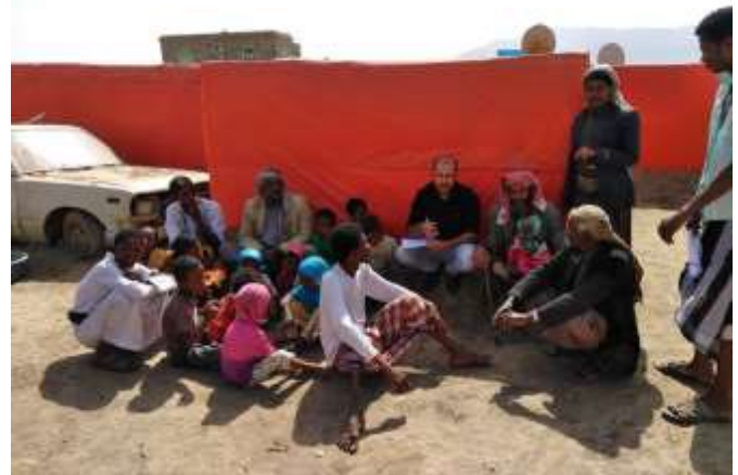
DRC conducting FGD in Saif IDP hosting site, Amran governorate.

Forcible eviction was reported by NAMCHA (National Authority for the Management and Coordination of Humanitarian Affairs and Disaster Recovery ) in Amran governorate committed by the landlords of Saif IDP hosting site, Raydah district which is accommodating around 120 IDP families (from the marginalized group). It is the land they had been squatting on for the past 3 years. Some IDPs were physically assaulted or arrested and their emergency shelters damaged. The SNCC and the DRC, the organization responsible for Site Management and Coordination at the site, in collaboration with NAMCHA managed to secure another site to which the affected IDPs will be moved. Coordination with Partners working in the area resulted in several Partners agreeing to provide some basic services in the new site, and remaining service gaps are being addressed.