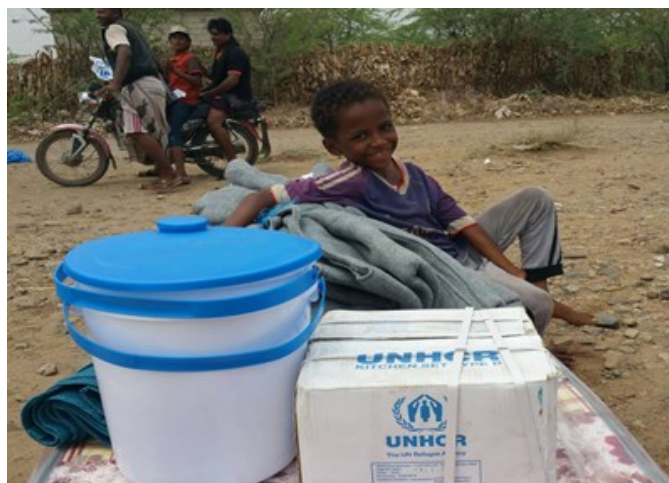
An IDP child smiling and feeling happy with the NFIs provided to his family, Al Hudaydah governorate.

NFIs distribution completed by UNHCR through JAAHD for 659 families and EESKs for 288 families in Ad Dahi district. The IDP children accompanied their parents to the distribution sites and they looked very happy when their parents received the assistance. It was observed that JAAHD had well-organized the distribution sites and prioritized vulnerable persons (i.e. elderly, women, boys and girls).