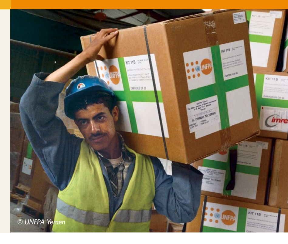
When the Reproductive Health Supply Chain is a Lifeline

In Yemen, 3.25 million women and girls of childbearing age need protection and medical care