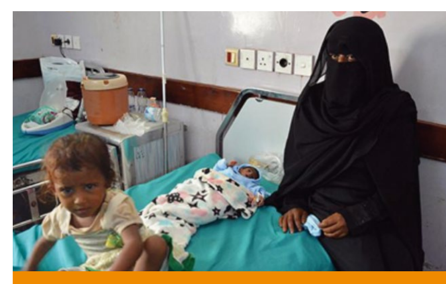
A post-partum mother with her newborn at the Al Thawra Hospital maternity ward.

In a country with one of the highest maternal mortality ratios in the Arab region, the lack of food, poor nutrition and the eroding health system, worsened by epidemics such as cholera and diphtheria, have increased the number of premature or low birth weight babies and of women suffering from severe postpartum bleeding. The process of giving birth has become much more lifethreatening. In 2015, the maternal mortality ratio was 385 maternal deaths out of every 100,000 live births.