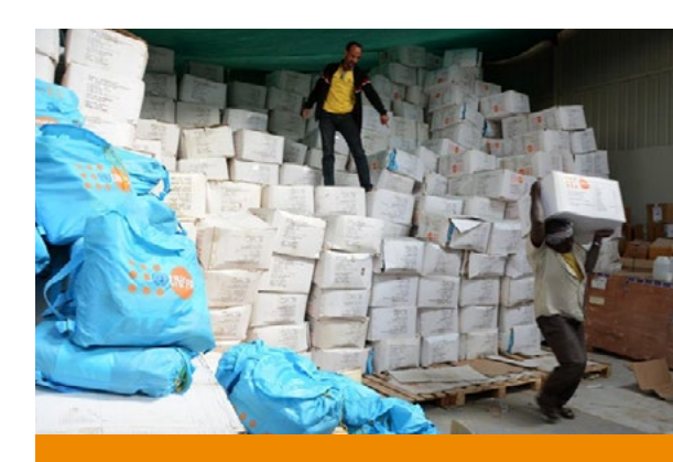
Warehouse with RH kits and dignity kits in Yemen, 2017.

Gender-based violence : UNFPA supports strengthening protection mechanisms including the engagement of men and boys as agents of change, in coordination with reproductive health programming.