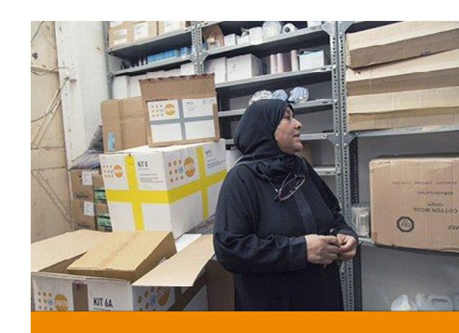
UNFPA-provided supplies include contraceptives, maternal health medicines, medical equipment and rape treatment.

Supporting local health providers and reliably providing reproductive health kits are important contributions to ensuring continuity of service delivery through functional health facilities, so many of which have been destroyed.