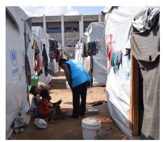
UNHCR transitional shelters in Aden in December 2018, housing families displaced from fighting in Al Hudaydah.

UNHCR continues to identify, upgrade and repair sub-standard shelters rented by refugees. Rented shelters are being improved to benefit refugee tenants and Yemeni host communities as part of the Basateen Roadmap project to improve living conditions and foster social cohesion. Basateen is a neighbourhood on the outskirts of Aden, where a large number of vulnerable refugee families are living. In 2018, UNHCR made improvements to 190 homes in Basateen that are rented by refugees, and a further 300 will be repaired or upgraded in 2019.