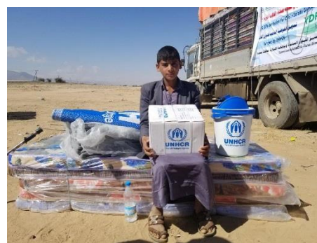
An IDP receiving essential NFIs in As Safra district, Sa'adah governorate.

NFI and EESK kits distributions were completed by UNHCR through YDF (Yemen Development Foundation) to 275 families in As Safra district, 20 families in A Khafgi area located in Sahar district, 451 families in Sahar and Sa'adah districts, 139 families in Haydan district while only NFI kits were provided to 1,000 families in AlMaton district (Al Jawf). In-kind winterization items were distributed by ACTED to 2,500 families in Majz and Saqayn district in Sa'adah governorate. The items were blankets and clothes. Transfer of cash assistance for rental subsidies completed to 3,974 families in Al Jawf governorate and 1,556 families in Sa'adah governorate.