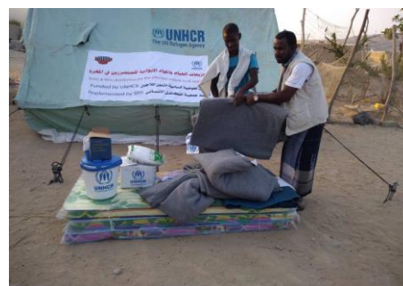
IDPs receiving essential NFIs and family in Al Maharah governorate.

NFI and EESKs distribution completed by UNHCR through NMO for 3,986 IDP families mainly targeting IDP hosting sites in different governorates including Al Dhale'e, Aden, Lahj, Abyan, Taizz and Al Hudaydah. NMO distributed NFIs to 305 families in Aden governorate and 33 families in Khanfir district of Abyan governorate also family tents distributed to 306 IDP families in Khanfir district. NFI kits were also distributed by UNHCR through SHS (Society for Humanitarian Solidarity) to 1,522 IDP families in Shabwah and Al Maharah governorates and through NRC, 97 IDP families assisted in Tuban (Lahj), 17 IDP families in Khanfir district (Abyan), 254 families in Al Ma'afer district and 745 families in Ash Shamayatayn district (Taizz) and through DRC, 143 families assisted in Al Khawkhah district (Al Hudaydah). Training on SMC (Site Management and Coordination) completed on 4 th of December with participation from Cluster leads, Partners, local authorities and Sites Focal Points. Transfer of cash grants for rental subsidies completed for 489 families in Aden, 192 families in Al Hudaydah, 349 families in Hadramaut, 570 families in Lahj, 97 families in Shabwah, and 440 families in Taizz.