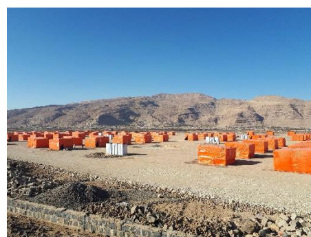
The new IDP hosting site in Kharif district, Amran governorate.

The SNCC and the DRC, the organization responsible for Site Management and Coordination at the site, in collaboration with NAMCHA managed to relocate IDPs who used to reside in Saif IDP hosting site, Raydah district to new IDP hosting site in Kharif district. These IDP families were evicted by the landlords of Saif IDP hosting site, Raydah district which used to accommodate around 126 IDP families (from the marginalized group) including 14 families from Al Hudaydah in a land they had been squatting on for the past 3 years. Some IDPs were physically assaulted or arrested and their emergency shelters were damaged. The IDP families have been relocated after the new land was leveled, EESKs (Enhanced Emergency Shelter Kits) erected, 60 latrines constructed, 5 water points established, NFIs were distributed and RRM (Rapid Response Mechanism) distributions completed. Currently SNCC is coordinating with the food sector to provide food rations for the families and education sector to facilitate the transfer of IDP students to the nearby schools.