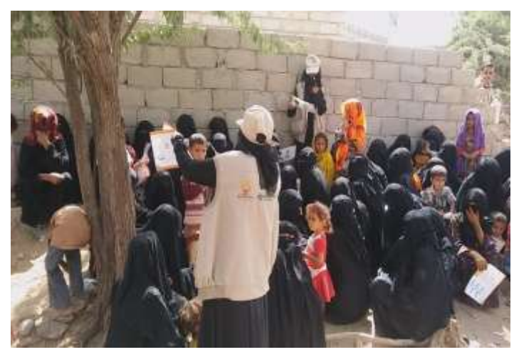
Figure 3: Gathering a huge number of people to explain the importance of personal hygiene as well as solid waste disposal.

Five of our community volunteers have conducted 15 awareness sessions on personal hygiene and solid waste disposal, targeting 500 individuals disaggregated (177 male, 313 female) in Al-Ahmol area of Fara Al-Udayin district of lbb Governorate. They also distributed soap bars, hand towels, and brochures about (chlorination, water purification, and hygiene practices).