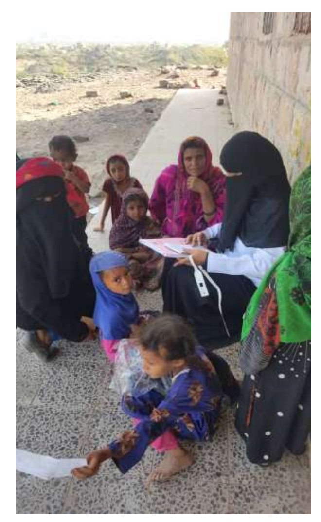
Figure 1: Providing TSFP services for under five children and PLW through our mobile clinics.

This program aims to prevent all children under 2 years and pregnant and lactating women from being acutely malnourished through the provision of Plumpy'Doz for children under 2 years and Super Cereals Plus for (PLW). In January RDP nutrition teams have distributed 204.582 Metric tons of Super Cereal plus for 34,097 Pregnant Lactating Women (PLW) and 36.35 Metric Tons of Plumpy'Doz for 24,230 children under 2 in approximately 104 Food Distribution Points (FDPs) over four Districts of Ibb Governorate.