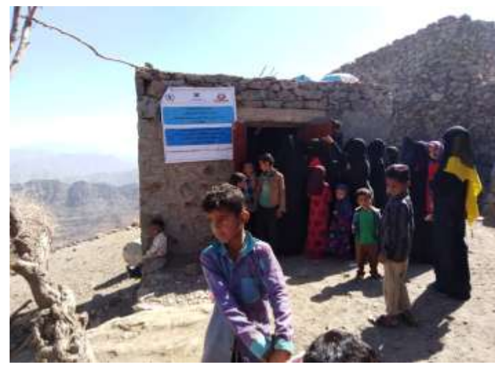
Figure 2: Providing BSFP services in a rugged cliff of a mountainous spot as it is one of our 104 FDPs over four districts.