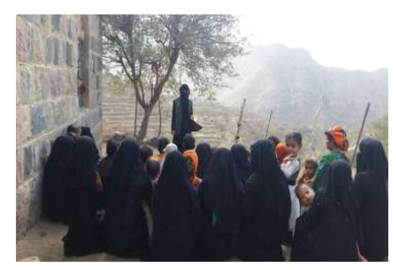
Figure 3: Conducting awareness sessions about important health and nutrition key messages in hard-to-reach areas.

As we continue the rehabilitation of Al-Hasha water well, the contractor has installed a solar pumping unit with all accessories to enable beneficiaries get water out of the well. Approximately 1,784 individuals of IDPs and affected host community (824 women, 796 men, 164 children) are benefiting from this project.