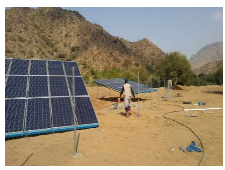
Figure 1: Installing solar pumping unit for Al-Hasha water well in Fara Al-Udayn district of Ibb Gov.