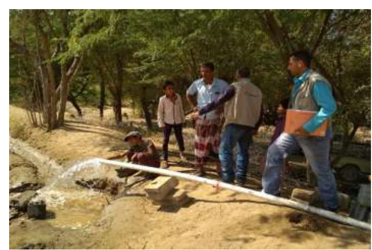
Figure 2: Pulling water out of the well after the installation of the solar pumping unit.