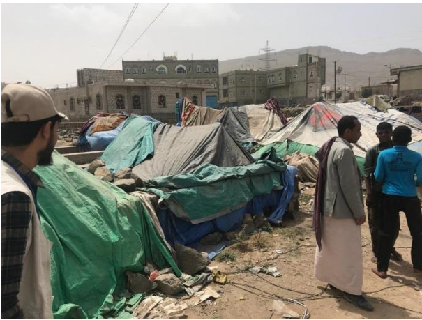
An IDP hosting site in Yarim district of Ibb governorate where IDPs are living in difficult situation.

SNCCs went on field missions to As Saddah and Yarim districts to identify locations and beneficiaries to be provided with RHUs (Refugee Housing Units). The situation of IDP families found in Yahasb playground and souq Amad sites were very dire since about 18 families are living in the open or unfinished buildings. Families lack access to essential household item, appropriate shelter support and WASH including hygiene items. Landlord of unfinished building threatened the families to evict them. Over 30 child are not enrolled in the school since they cannot afford to pay the tuitions fees. The sites do not self-governing structure. Two cases were found requiring medical attention.