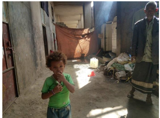
A displaced child living in very dire conditions in Hawrah Stadium located in Hajjah governorate.

limited warehousing capacity in the governorate and lack of regular exchange of information about the needs of affected population and the situation in the IDP hosting sites.