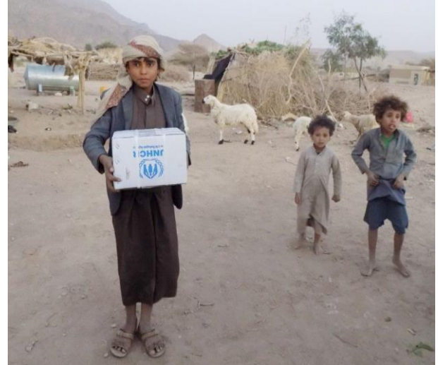
A displaced child carries household items provided by UNHCR in Al Humaydat district of Al Jawf governorate.