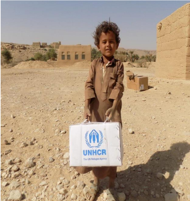
A displaced child carries household items provided by UNHCR in Al Humaydat district of Al Jawf governorate.