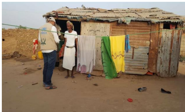
An IDP is being interviewed by JAADH (Jeel Albena Association for Humanitarian Development) in Al Hudaydah governorate.

The situation in Al Hudaydah governorate witnessed ground fighting and airstrikes, mainly in Al Hudaydah City. Reports suggested return of some displaced families to their homes. Humanitarian agencies continued to scale-up their programs to respond to the huge needs of affected population.