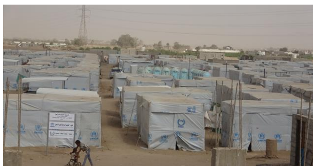
Shelters provided by UNHCR to IDPs in Sabir hosting site, Tuban district, Lahj governorate.

The fighting in Lahj, Al Dhale'e and Taizz governorates in addition to Al Hudaydah governorate continue to push families who have no choice but to leave their homes and seek safety. Reports indicated that families tend to settle in south Taizz, Aden, Lahj and Abyan governorates.