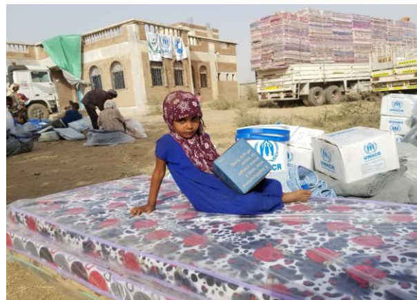
An IDP child received NFIs distributed by JAADH (Jeel Albena Association for Humanitarian Development) in Al Hudaydah governorate.