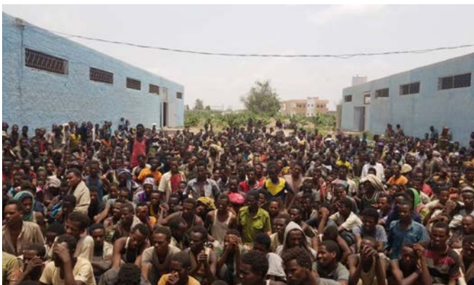
700-1000 MIGRANTS HELD AT A MILITARY CAMP IN LAHJ GOVERNORATE.