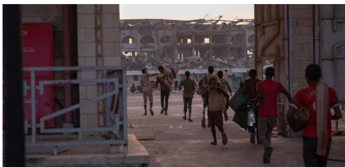
MIGRANTS ARE MOVED TO THE OPEN AIR STADIUM BEFORE DARK TO SLEEP.

An additional 700-1000 people are detained at an operational military camp in Lahj governorate and it has been reported that more migrants are being held in other locations; IOM is working to confirm this information. The authorities plan to move all the migrants from the 22nd of May sports complex to the military camp. The proposed sites are a few empty, damaged buildings that are not designed to accommodate people. Clean water and safe sanitation are not currently available for the thousands that may be detained and access will be difficult for humanitarians due to security concerns, as it is an operational military base. The authorities have noted that this is a temporary arrangement until they construct a built-for-purpose migrant detention centre in Ras Al-Ara, Lahj governorate. They have also stated that the final step in this campaign is to return the migrants to their countries of origin.