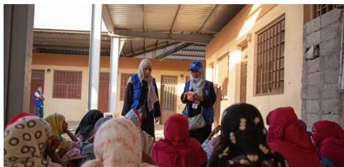
WOMEN DETAINEES TAKE PART IN A HYGIENE PROMOTION SESSION.