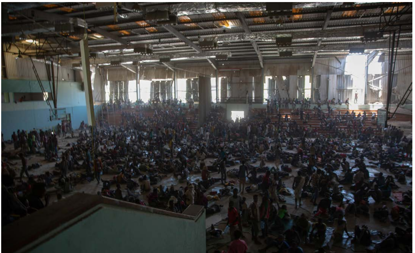
OVER 2,400 MIGRANTS DETAINED IN THE DISUSED GYM IN THE 22ND OF MAY STADIUM AND SPORTS COMPLEX.