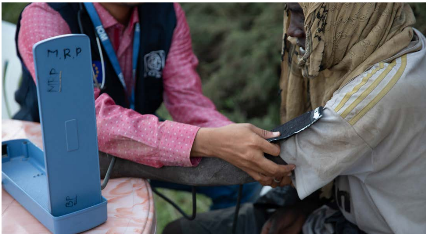
AN IOM DOCTOR TREATS A MIGRANT IN IOM'S MOBILE CLINIC AT THE 22ND OF MAY STADIUM AND SPORTS COMPLEX.