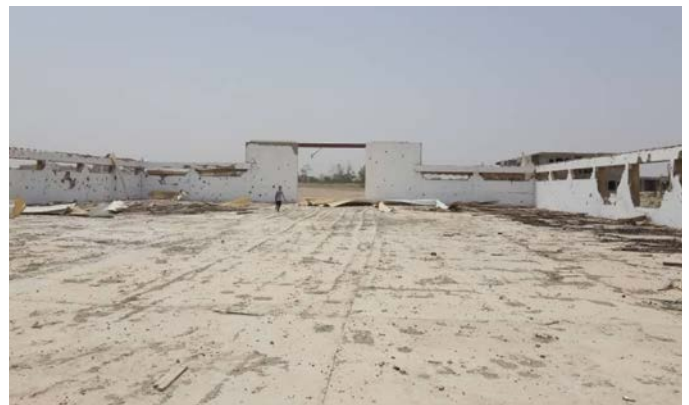
SECOND UNPREPARED SITE AT THE MILITARY CAMP IN LAHJ.