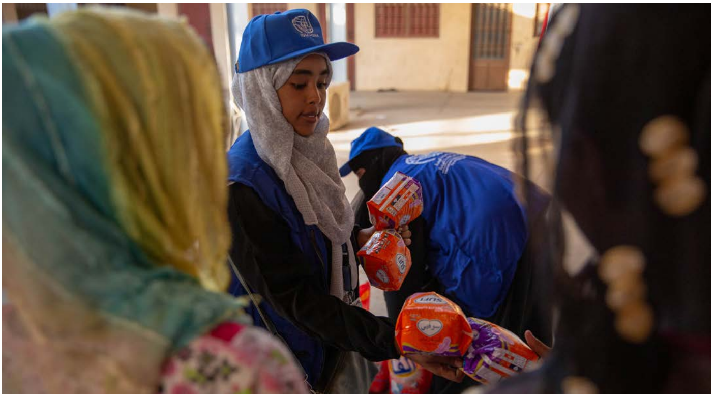
IOM DISTRIBUTES SANITARY ITEMS TO THE WOMEN DETAINED AT THE 22ND OF MAY STADIUM, ALONG WITH OTHER ESSENTIAL ITEMS TO HELP THEM MAINTAIN SOME DIGNITY.