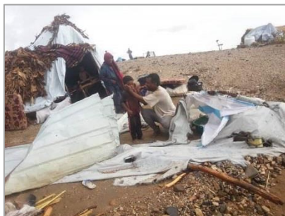
A displaced family near their damaged tent at one of the hosting sites in Aden. Heavy rains recently hit Aden and 11 other governorates (out of the 22 in Yemen).

Despite some improvement in the weather conditions since recent storms raged across Yemen, logistical challenges are hampering UNHCR's ability to respond to displaced (IDP) families in the southern governorates of Ibb and Taizz, especially in Taizz where main roads have suffered extensive damage. Local authorities report that preliminary assessments identified more than 1,890 families affected by the recent floods. Following Field Office Ibb's month-long ongoing request, local customs have released 1,600 core-relief items (CRIs). The distribution of these stocks will start as early as next week for the families in Al Dhale'e, Ibb and Taizz.