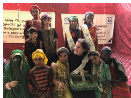
A UNHCR staff member in Aden sits with young Somali refugee girls in their traditional clothes in celebration of World Refugee Day.

On the occasion of World Refugee Day, UNHCR's Head of Sub Office Aden acknowledged the efforts and hospitality of the Yemeni Government and its people, who have continued to host some 275,000 refugees and asylum-seekers despite ongoing difficulties. Yemen is the only country in the Arabian Peninsula that is a signatory to the 1951 Refugee Convention and its 1967 Protocol. An event was held in the Basateen neighbourhood, Aden governorate where some 15,000 refugees, IDPs, IDP returnees and extremely vulnerable members of the local community are hosted.