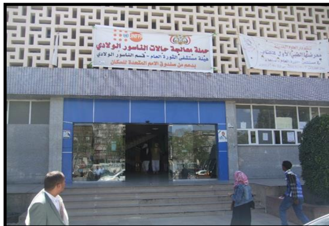
Al Thawra Hospital in Sana'a providing free fistula treatment services in Yemen

UNFPA has supported the establishment of three fistula units within national referral hospitals in Aden and Sana'a. These are Al Sadaqa Hospital in Aden and Al Thawra Hospital and Al Sabeen Hospital in Sana'a. In 2018, more than 80 fistula surgeries were successfully conducted free of charge in the three hospitals, and a further 20 successful surgeries being completed since the beginning of the year 2019. Support is being offered to building skills of health personnel in treating obstetric fistula with advanced trainings. In addition, UNFPA has supported the establishment and strengthening of a network between community volunteers, community midwives, reproductive health and fistula experts from almost all governorates to help women suffering from fistula get the services they need, including providing free transportation from rural areas.