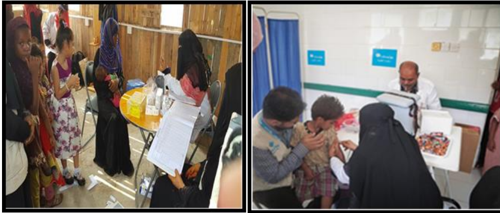
Mobile Clinic services in Al-Shabb IDP center in Aden and Monitoring Measles Campaign in Mukalla