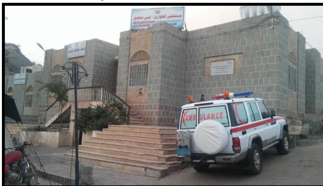
An ambulance in Bani Mansoor hospital, ready to transport a patient on referral

Due to lack of hospital in most rural areas, coupled by economic hardship, most of the people in the rural areas, are not able to access health care immediately in case of any medical emergency. Based on this, International Medical Corps in coordination with Sanaa GHO and DHO in Alhymah Alkharjia district are providing communities with 24-hour medical ambulance services, that is well equipped, and with two medical assistants, trained in handling emergency cases prior to reaching the hospital. In order to improve coordination and speed up referral, CHVs in the village with a case refer the CHV supervisor, CHV supervisor in charge of the district, who then informs DHO about the case. DHO provides approval for the ambulance to be dispatch for referral. In the month of May, a total of 24 cases have been referred (13 for delivery, 1 SAM case with complication, 1 malaria case with complication, 1 childhood medical complication and 8 other chronic complications). In addition, International Medical Corps has equipped and provided supplies to delivery room in Bani Mansoor hospital in Alhymah Alkharjia district, in order to support safe deliveries at district level, reduce cases of complication during delivery, and further reducing pressure on referral system.