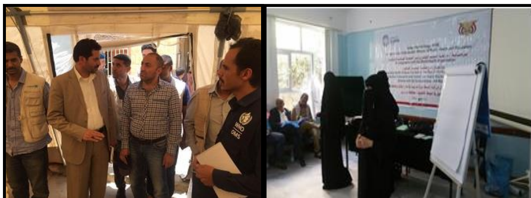
Field Visit to a DTC in Sa'ada and Infection Prevention and Control training – RH intervention – Photo Health Cluster

The SubNational Health Cluster Coordinators conducted 10 field visits in respective hubs while there was one (1) support mission to Aden Hub by the National Health Cluster during the month of May 2019.