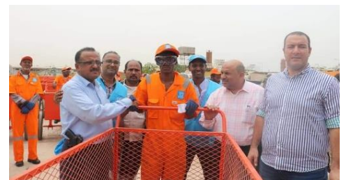
UNHCR distributes 40 sets of equipment to vulnerable refugees, IDPs, and the host community currently working in the recycling industry in Aden governorate.

On 10 July, UNHCR distributed equipment that included safety uniforms, safety gloves and shoes, eye protection, and garbage bags to 40 vulnerable refugees, IDPs, and host community members working in the recycling industry within Aden governorate. This initiative was coordinated with the ExU, with the aim of supporting beneficiaries generate their income in safety and dignity. With the provided items, the beneficiaries were able to collect enough scrap metal and plastic to sell onto wholesalers; increasing their output four-fold. This project also supports the Yemeni government in improving public hygiene. UNHCR plans to distribute equipment to an additional 300 beneficiaries this year, as part of its quick impact projects—small, rapidly implemented schemes to strengthen resilience and help create conditions for peaceful coexistence between those displaced and their hosting communities.